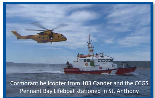
Cormorant helicopter from 103 Gander and the CCGS Pennant Bay Lifeboat stationed in St. Anthony